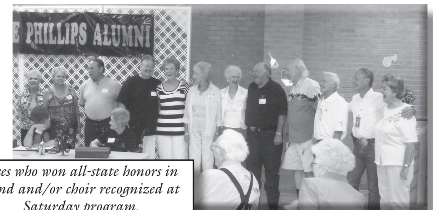
Exes who won all-state honors in band and/or choir recognized at Saturday program.