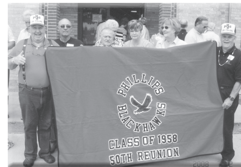
Several Class of '58 members display 50th Reunion Blackhawk blanket.