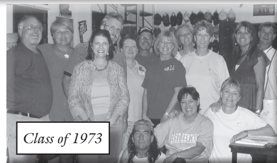
Class of 1973