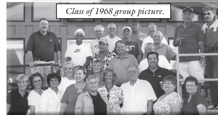
Class of 1968 group picture.