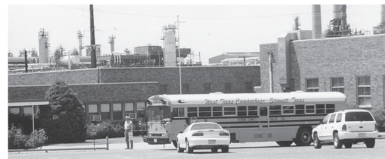
Tour bus at former Phillips Elementary School.