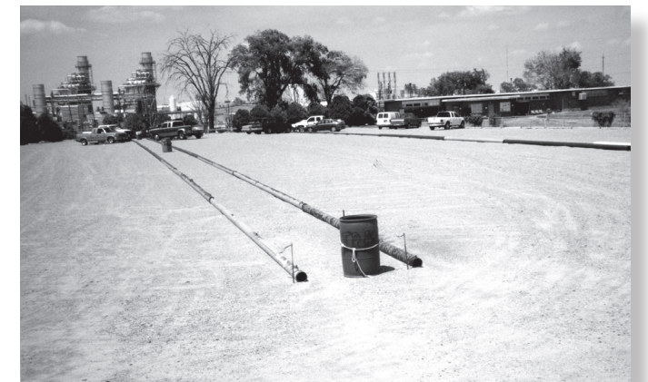
Sad, but True - PHS football field today...an unpaved parking lot. Old Fieldhouse, still intact, in background.