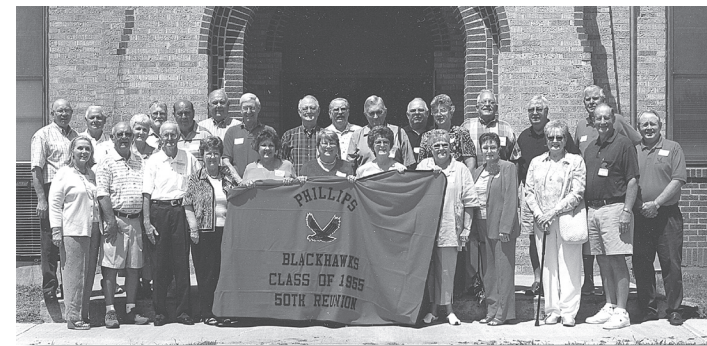
"Looking Iffy? at the Big Fifty"