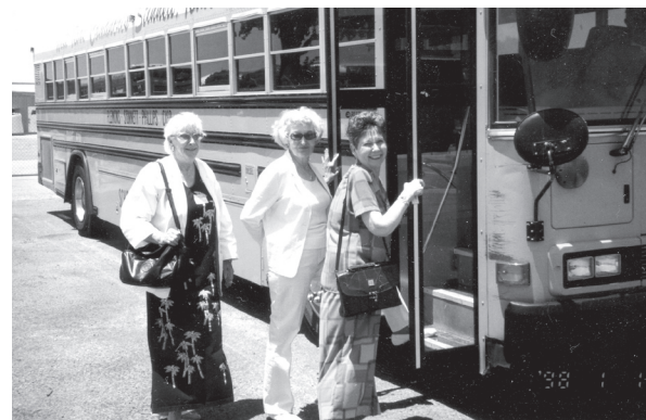
Exes (unidentified) board bus to tour Phillips.