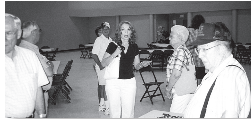
Hey, anybody here in my age group?